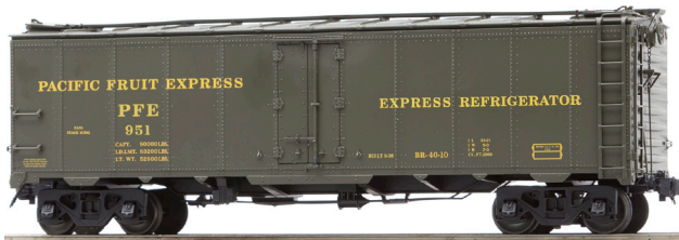
PFE EXPRESS REEFER BR-40-10