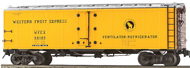
WESTERN FRUIT EXPRESS