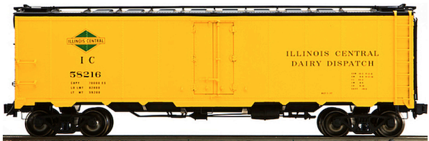
ILLINOIS CENTRAL DAIRY DISPATCH