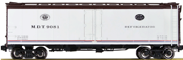
MDT LACKAWANNA RAILROAD