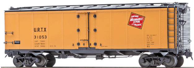
MDT LACKAWANNA RAILROAD