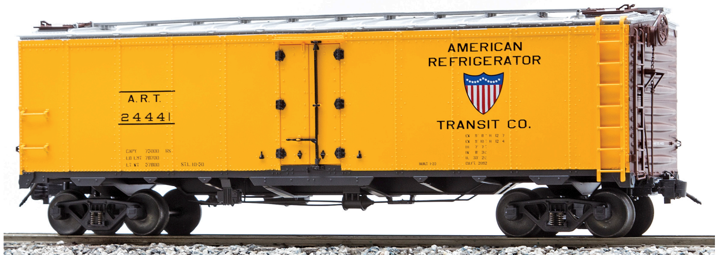
AMERICAN REFRIGERATOR TRANSIT