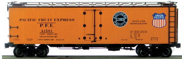
PFE REEFER DOUBLE HERALD